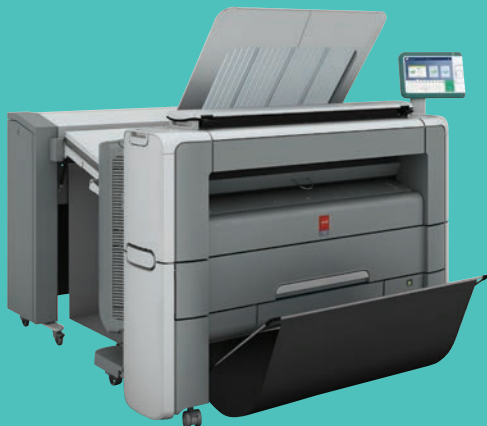
WITH OPTIONAL OCÉ ESTEFOLD 2400 FANFOLD