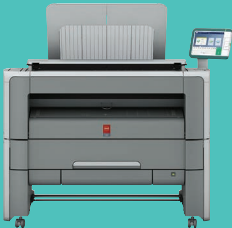
WITH OPTIONAL SCANNER EXPRESS II

You can access your projects' documents directly at the printer using the Océ ClearConnect multi-touch user panel. Are your files on a USB stick, on a network location or in the cloud? Just browse and swipe to your files and print them. In addition, you can scan directly to virtually unlimited destinations in the cloud or your Intranet. When you have a file on your iPad® mobile device, just use the WiFi infrastructure of your company to access the Océ PlotWave 340/360 printer and print via the Océ Publisher Mobile app. Or print from your desktop PC via Océ Publisher Select™ software to manage more complex document sets.