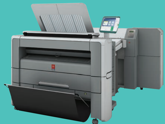
WITH OPTIONAL OCÉ ESTEFOLD 4312 FOLDER AND EXTENDED STACKER