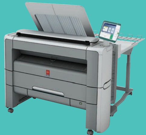
WITH OPTIONAL REAR DELIVERY TRAY