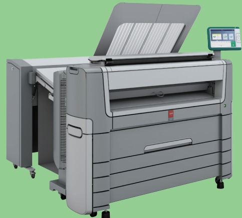
MULTIFUNCTION SYSTEM WITH OPTIONAL OCÉ 2400 FANFOLD