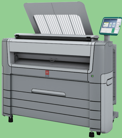
WITH OPTIONAL SCANNER EXPRESS II (MULTIFUNCTION SYSTEM)

Being able to submit files to your large format printer from anywhere can give you a big advantage when time is tight and deadlines are looming. The Océ ClearConnect software suite gives you more flexible ways to submit files to the printer. Print from your desktop via Océ Publisher Select™ software to manage complex document sets. With Océ Publisher Mobile, print from your smartphone or tablet when you are rushing to a meeting. Knowing you can print when you need to, can take some of the stress out of your work day.