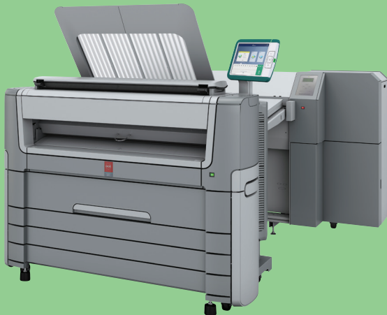
MULTIFUNCTION SYSTEM WITH OPTIONAL OCÉ 4312 FULLFOLD