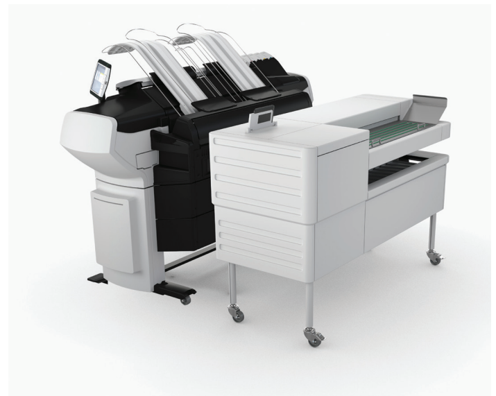
ColorWave 3600 4-Roll Printer with Folder Express 3011