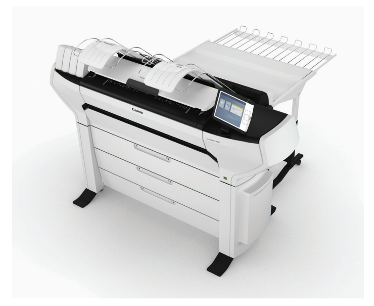
ColorWave 3800 6-Roll Printer with Stacker Select